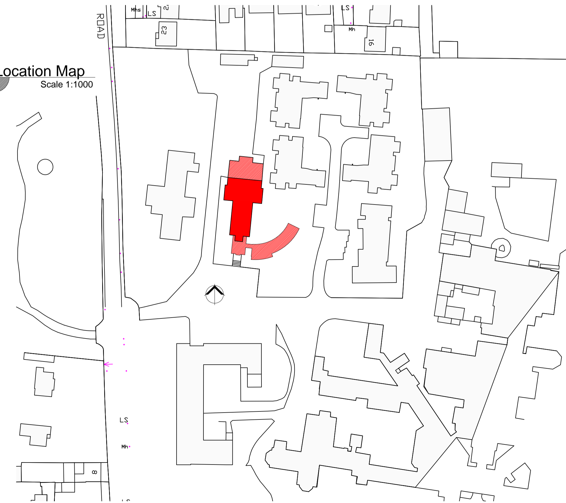
Location Map Scale 1:1000